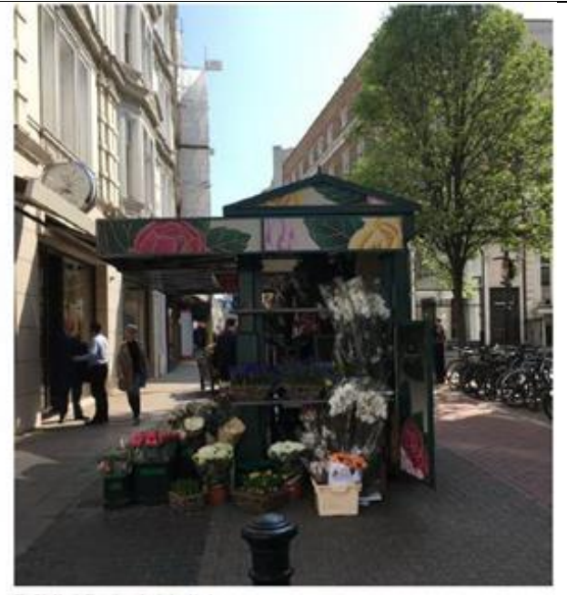
Fig 21. North Elevation of existing kiosk.