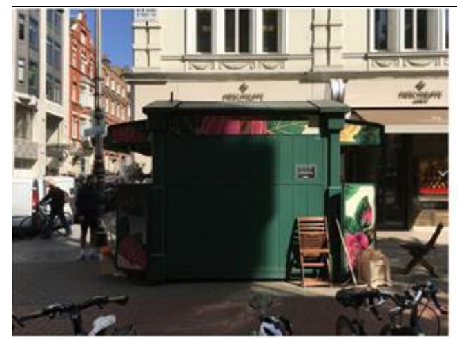
Fig 19. West elevation of existing klosk